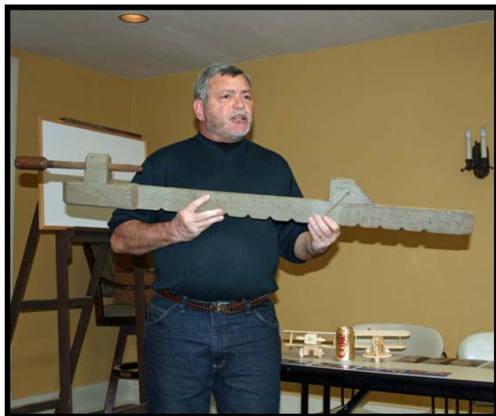
Tom Maxwell's antique clamp